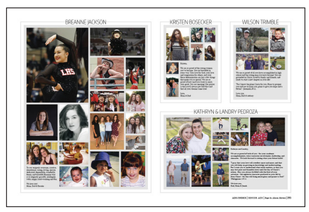
Sample from 2019 Yearbook